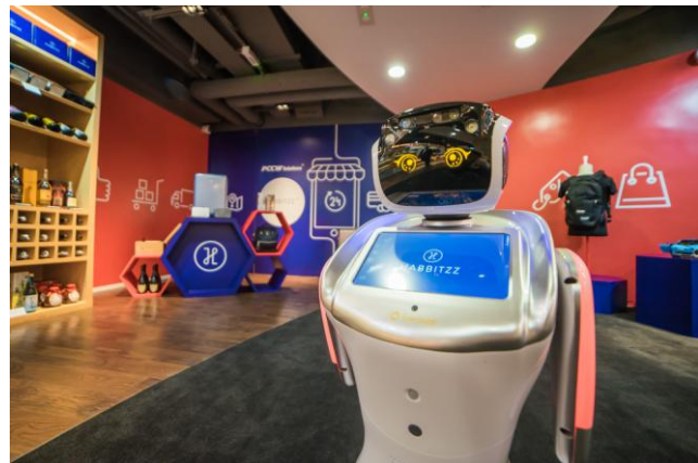
HABBITZZ+ intelligent unmanned store